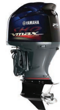
Yamaha VF250 VMAX